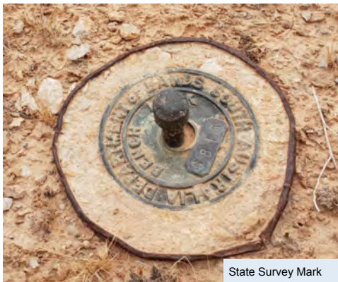
State Survey Mark

While you may not be actively aware of how this impacts your life, just think about aeroplane movements, driverless vehicles and farming equipment all using high precision Global Satellite location systems. Making sure our maps and GPS coordinates align helps continue to make travelling in planes and cars safe and assists farmers to cultivate with precision.