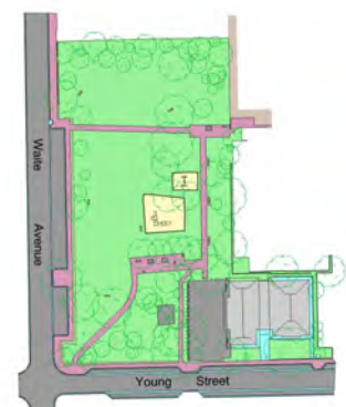
Plans from design to construction

Newsletter Quote ... If you don't like something, change it. If you can't change it, change the way you think about it. - Mary Engelbreit