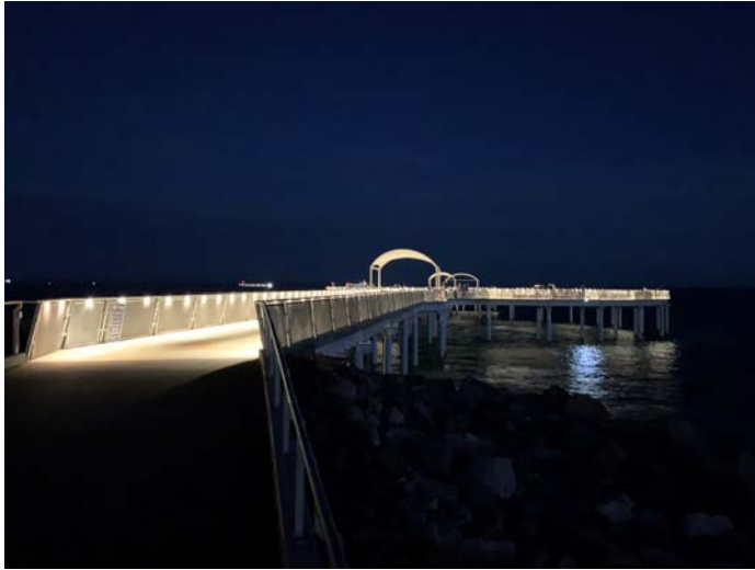
Whyalla Jetty at night