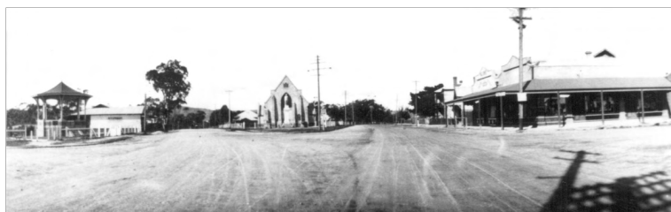
Five Ways prior to the roundabout

1958 – The roundabout at Five-Ways intersection was installed